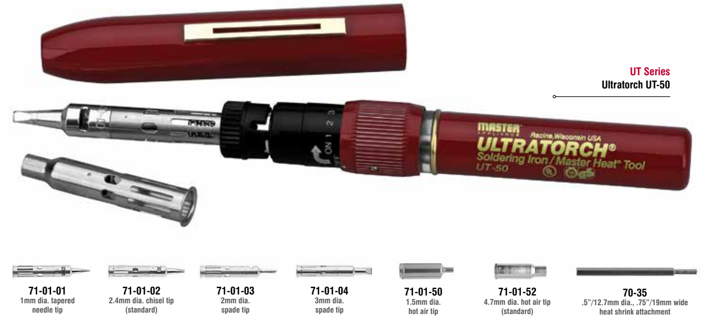
UT Series Ultratorch UT-50