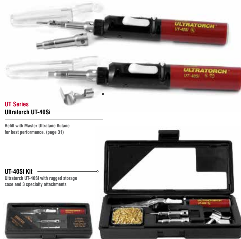
UT Series Ultratorch UT-40Si

Ultratorch® UT-40Si, UT-40SiH & UT-40SiK